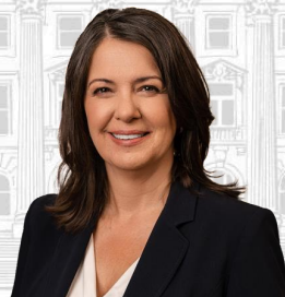
Honorable Danielle Smith, Premier of Alberta