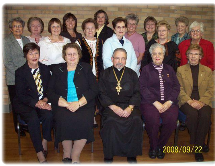
Ukrainian Women's Association of Canada -Alberta Provincial Executive