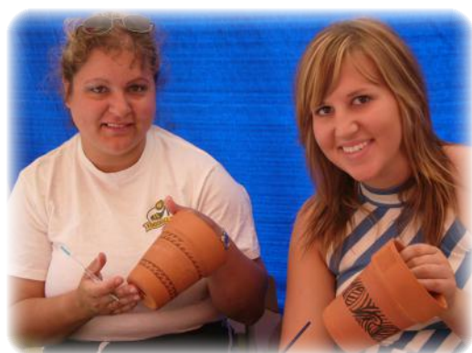
Participants at Ukrainian Day 2008