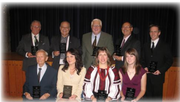
2006 HETMAN AWARD RECIPIENTS: