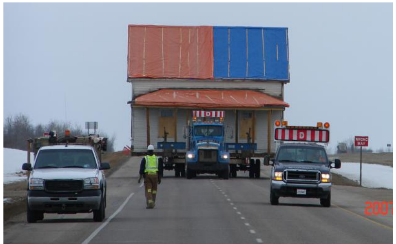
Hewko House is relocated to UCHV

Summer Staffing - 38 Historic First Person Interpreters were employed by the Friends Society through a Government service contract. In addition, the Friends hired and administered the staff for the Admissions Booth, Gift Shop, Food Service and Historic Children's Program, with contracts for costuming services, services related to the Village Enrichment Project such as research and construction services. The Friends provided administrative support for the Alberta-Ukraine Genealogy Project that also oversees the Centennial Pioneer Recognition Program. The Pioneer Recognition Program was a big part of the Ukrainian Day celebration that was held in cooperation with the UCC-APC.