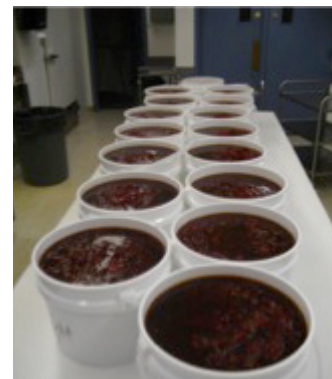
Forty-eight gallons of borsch ready for pick up for Heritage Days