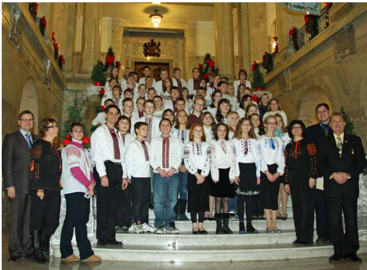
Photo - Students of the AB Bilingual Program during the 1st Anniversary of the Holodomor Memorial Day Act at the Legislature