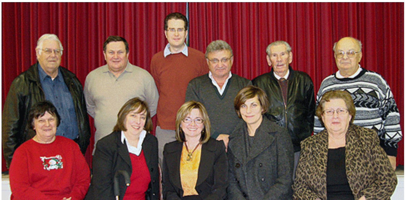
Photo - UCC-APC Board Members at the 2009-10 AGM at St. Elia's Ukrainian Orthodox Church (a few missing)