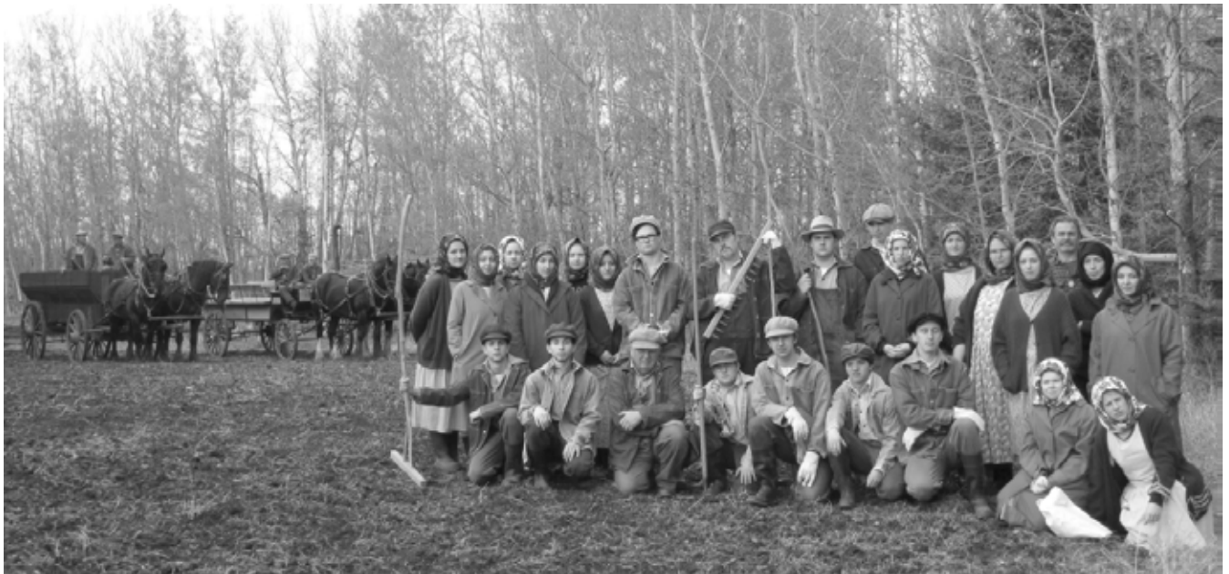
Photo - Volunteers and Staff of the Ukrainian Village