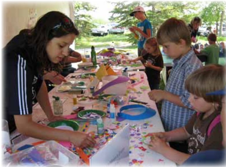
Photo - ACUA Crafts Tent at the Ukrainian Day Festival 2010