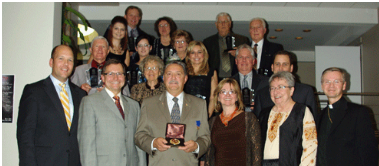
Photo - UCC-APC Hetman Awards Recipients with distinguished guests, October 4, 2009