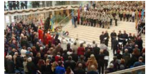
UCC - Edmonton Holodomor commemoration at Edmonton City Hall, Nov. 28, 2015