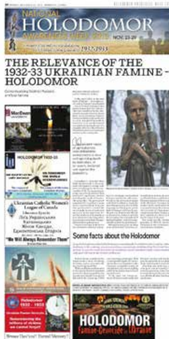
Edmonton Journal Insert, November 23, 2015

of Ukrainian Canadians. All leaders of the official opposition, PC, Liberal, and Alberta party, gave commemorations. The song "Dry Tears" and "Vichnaja Pamjat'" were sung by the Ukrainian Bilingual Program students of St. Martin and St. Matthew Catholic School Choirs.