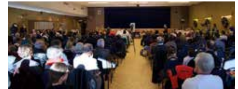
UCC - Calgary Holodomor commemoration at St. Vladimir's Ukrainian Cultural Centre, Nov. 28, 2015

In Calgary, UCC - Calgary held an Evening Candle light Vigil, Friday November 27, 2015 at Memorial Dr. and Edmonton Trail. On Saturday, November 28, 2015 a memorial commemoration was held at St. Vladimir's Ukrainian Cultural Centre.