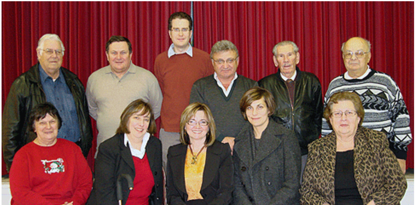
Photo - UCC-APC Board Members at the 2009-10 AGM at St. Elia's Ukrainian Orthodox Church (a few missing)