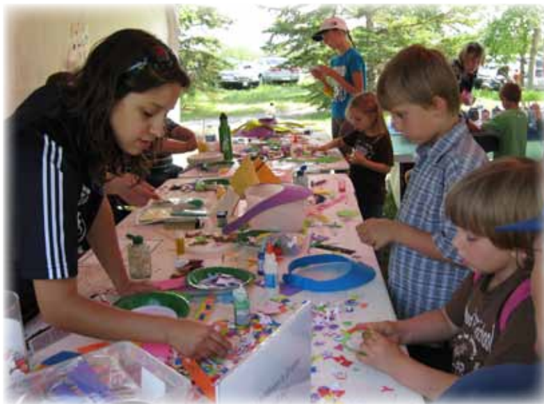
Photo - ACUA Crafts Tent at the Ukrainian Day Festival 2010